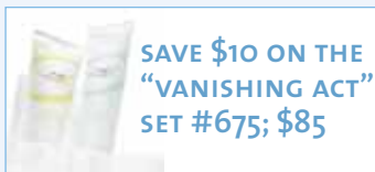
FIGURE 8 VANISH™ 2-STEP CELLULITE SYSTEM

(Horse chestnut) anti-inflammatory helps tone veins and fights water retention.